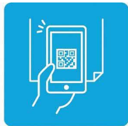
USE THE HOKKAIDO CORONA NOTIFICATION SYSTEM AND THE COVID-19 CONTACT-CONFIRMING APP (COCOA)