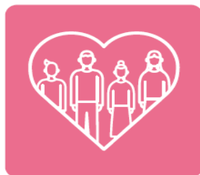
STAY INFORMED & BE CONSIDERATE