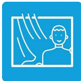
CIRCULATE THE AIR