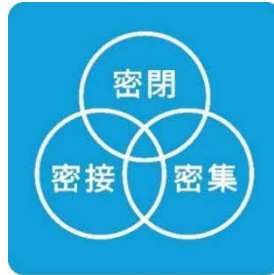
AVOID THE 3 C's