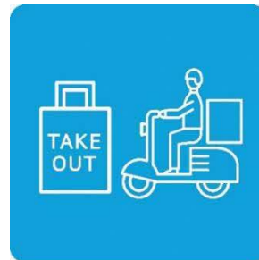
CONSIDER TAKE OUT AND DELIVERY