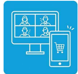
MAKE GOOD USE OF ONLINE SERVICES